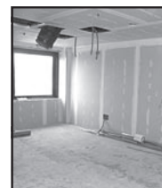
The beginnings of a new labor/delivery/recovery/postpartum room