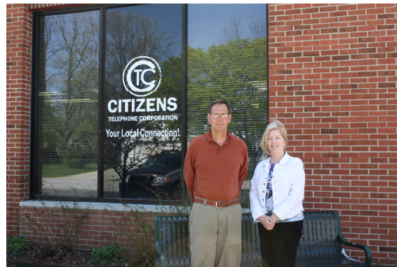
TASTE OF SPRING SPONSORS